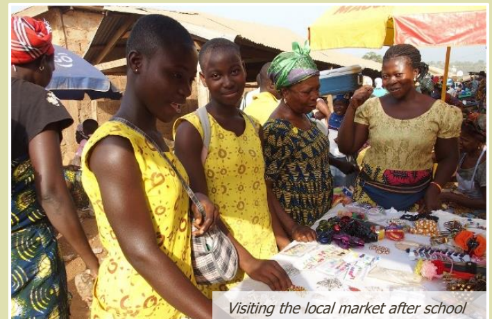
Visiting the local market after school