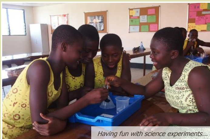
Having fun with science experiments...