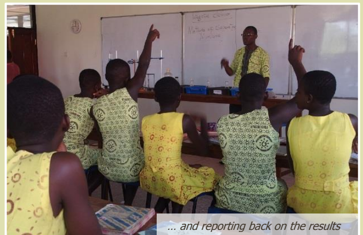
... and reporting back on the results