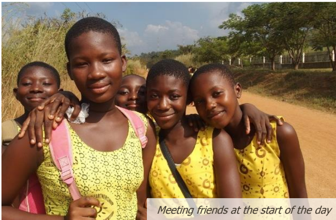
Meeting friends at the start of the day