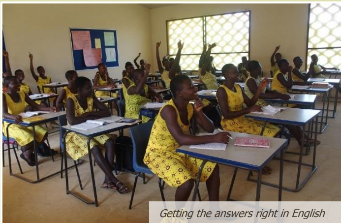
Getting the answers right in English