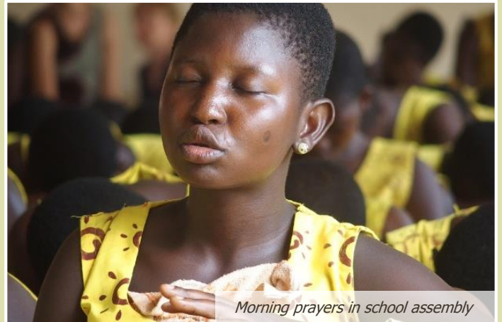
Morning prayers in school assembly