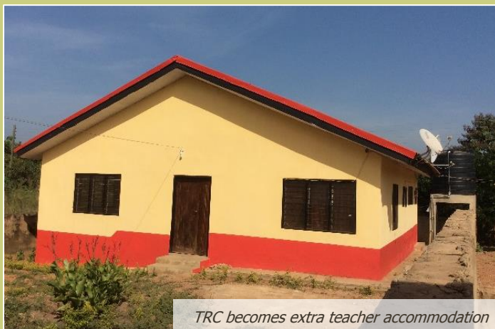
TRC becomes extra teacher accommodation

At the same time, we are also converting GEP's Teacher Resource Centre into an additional accommodation block for KGS teachers. This was GEP's first building in Nkwanta but is surplus to requirements since the school opened.