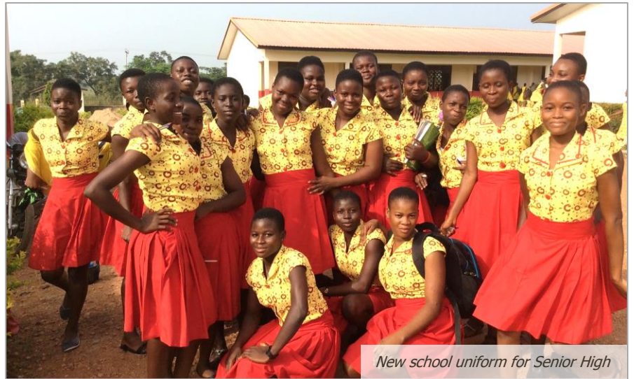
New school uniform for Senior High