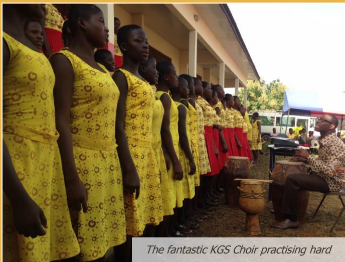
The fantastic KGS Choir practising hard