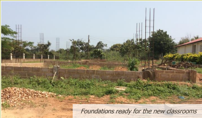
Foundations ready for the new classrooms

To accommodate this increased capacity, work is already underway on a new building at KGS, which will include four extra classrooms and a school office.