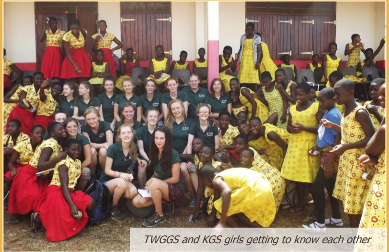
TWGGS and KGS girls getting to know each other

From the moment we got on the plane in October, we were all raring to go and it was hard to keep the smiles off our faces as we stepped out into the sweltering heat of Ghana; our trip had truly begun. From then on, not a moment passed when we didn't feel welcomed in this country of such beauty. As soon as we arrived in Ghana, the original itinerary was out of the window, as we went to meet the whole of Nkwanta at a presidential rally for the 2016 election. This day made a big impact on us all as it was our first real sense of Ghana: surrounded by the beaming faces of children, drumming, dancing and the vivid colours of the country.