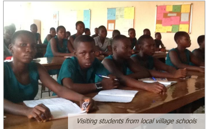
Visiting students from local village schools

Kyabobo Girls School regularly welcomes guests from some of the more basic schools in neighbouring villages, who come to experience our high quality science facilities by taking some classes with us.