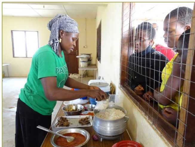
Above: Delicious school lunches from our well-equipped kitchen