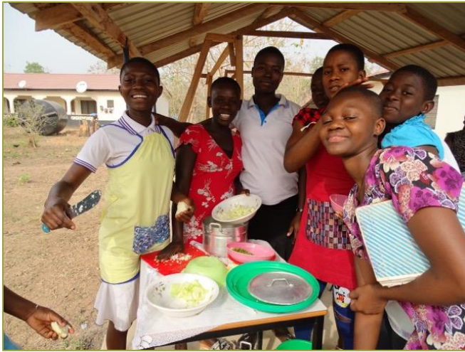
Above: Food technology lessons in our outdoor teaching area