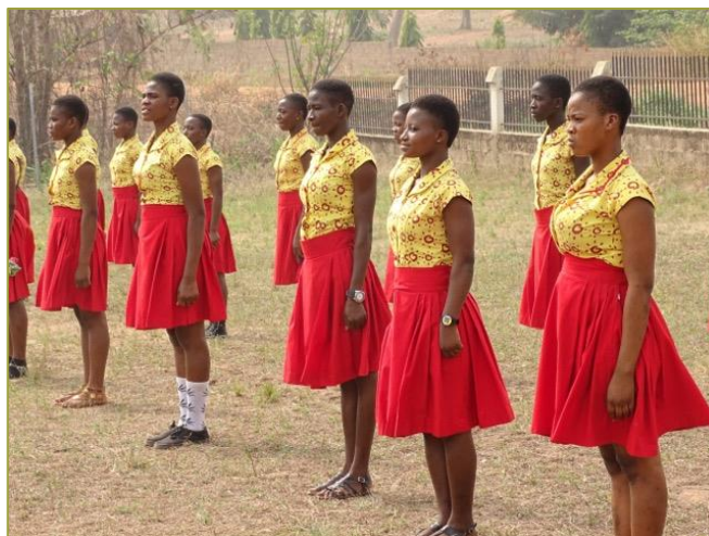
Above: Our school cadets on parade on the KGS playing fields