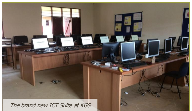
The brand new ICT Suite at KGS

We have also made great progress on installing a fantastic new computing suite at the school, complete with full Internet access. We are aiming to equip all KGS girls with essential ICT skills to accelerate their learning in other subjects and significantly improve their future prospects in the digital age.