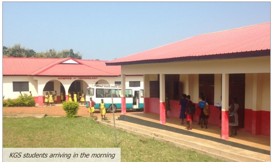
KGS students arriving in the morning