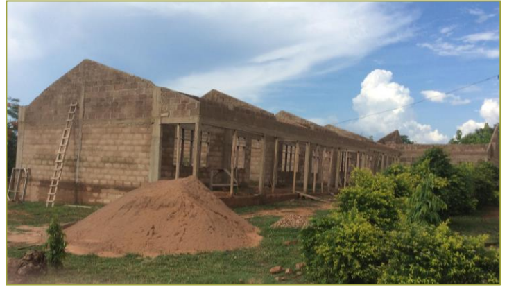
Above and below: Progress on our brand new classroom block

This is a huge 60% increase on our initial target of 300 pupils and a new building is under construction to accommodate this increased capacity.